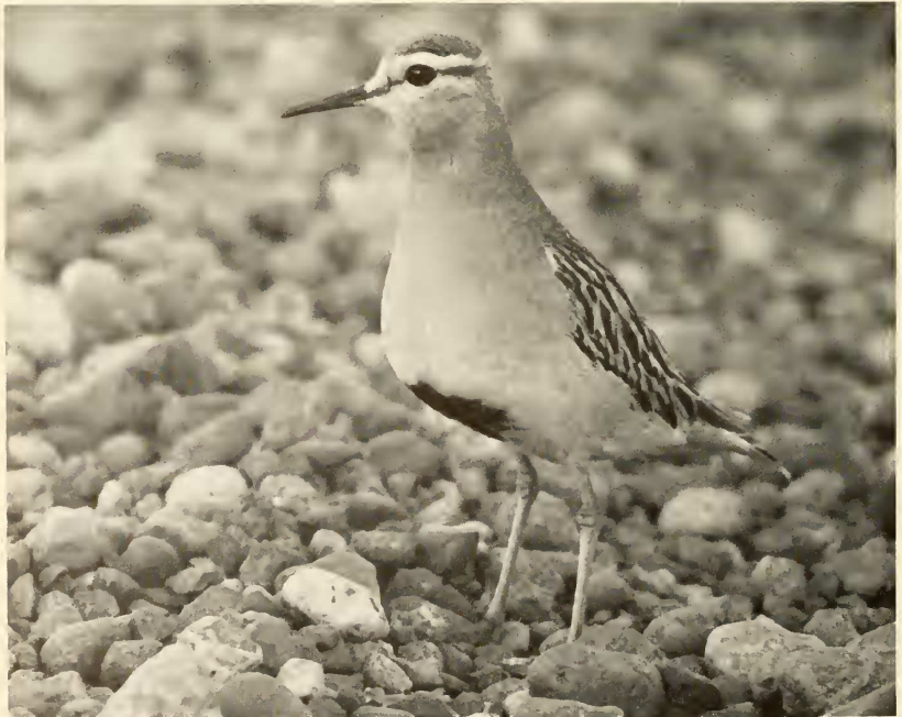
Figure 2. Tawny-throated Dotterel ( Oreopholus ruficollis ).